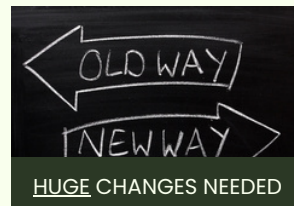
HUGE CHANGES NEEDED