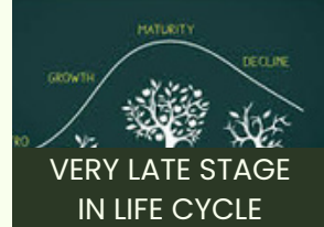
VERY LATE STAGE IN LIFE CYCLE