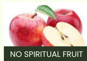
NO SPIRITUAL FRUIT