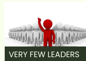
VERY FEW LEADERS