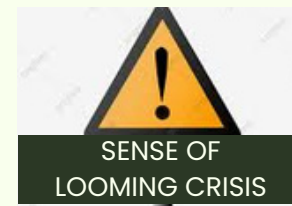
SENSE OF LOOMING CRISIS