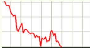
7+ YEARS OF DECLINE