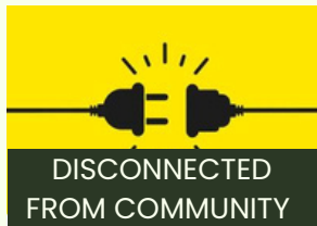
DISCONNECTED FROM COMMUNITY